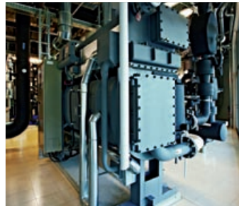
Figs. (from left to right): Daylight use in manufacture, CHP station, Absorption-type refrigerating system